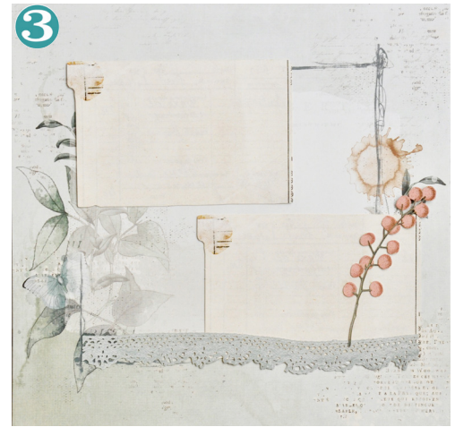
Photo Size: Five 2.25" x 2.25" (alternate - use 9 photos and skip the decorative papers used on corners)

Step 1 – Start with the background paper. Image 1. Gather all the laser cuts, chipboard and ephemera pieces as shown in Image 2. The following are the chipboard pieces - the large 9-photo frame, a large pink stemmed flower and one pink button heart. You will need to fussy cut the bow from the reverse of the cover sheet. The remaining pieces are from the laser cut sheet. You can use the reverse of the patterned paper background to see detailed images of pieces required LEVEL UP: You can distress or ink the edges of the patterned paper and ephemera pieces for a more vintage look.