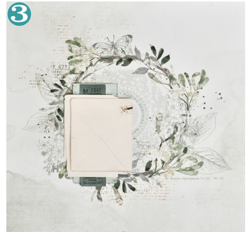
Photo Size: One 2.75" x 2.75" (trimmed to fit behind the map edged frame)

Step 1 – Start with the background paper. Image 1. Gather all the laser cuts, chipboard and ephemera pieces as shown in Image 2. The top right of the image shows the chipboard pieces - the “Always You” & blue foliage circle, one smaller heart, two heart buttons, small “Document” label, two green flowers & thirteen small round pieces. The remaining pieces are from the laser cut sheet. You can use the reverse of the patterned paper background to see detailed images of pieces required. LEVEL UP: You can distress or ink the edges of the patterned paper and ephemera pieces for a more vintage look.